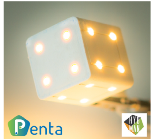
“Fully Additive” 3D Printed LED Array